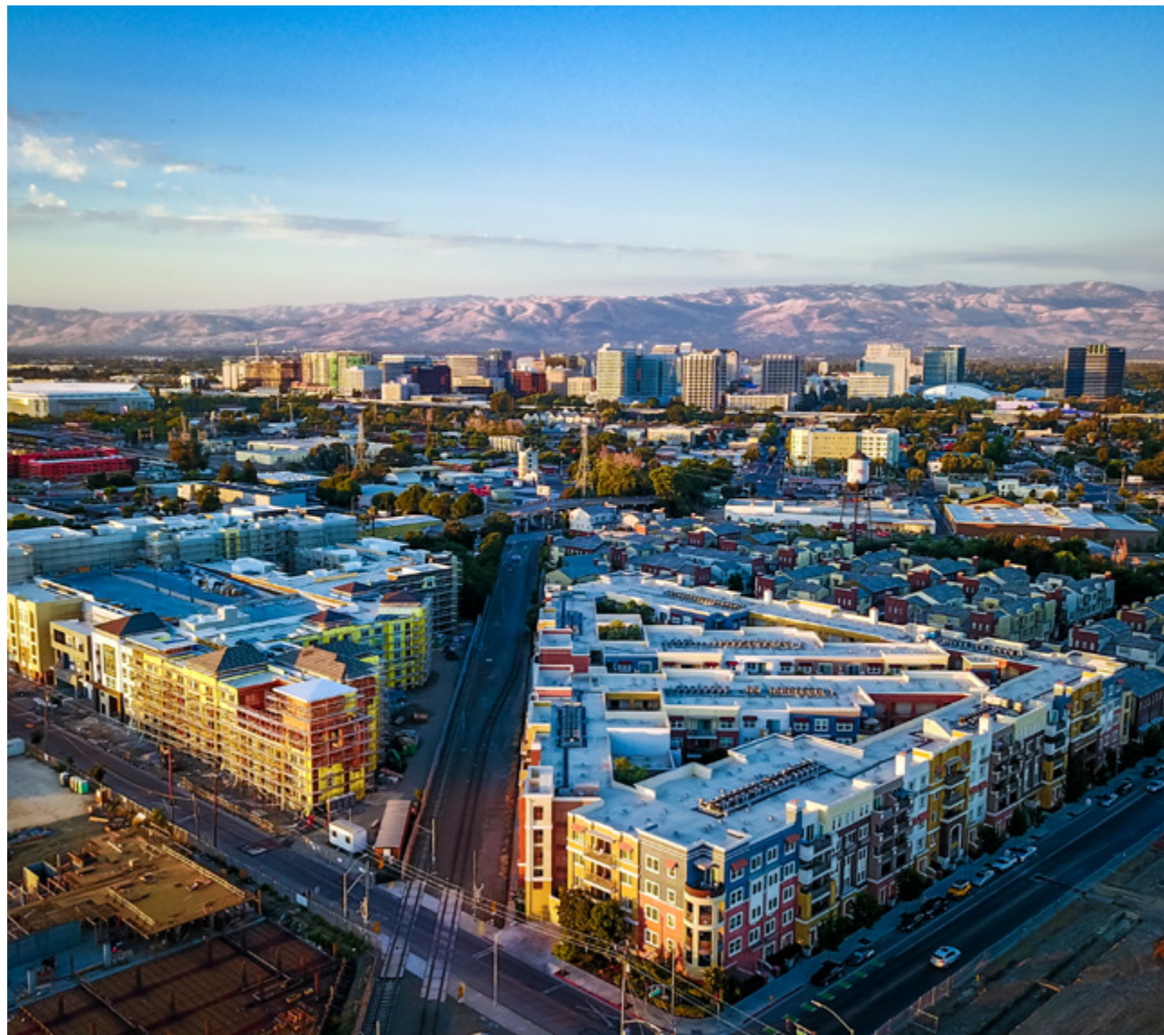
Silicon Valley, San Jose - California

Innovation is one of the key ways to achieve much-needed productivity in Australia, but it needs to be backed by inclusive and credible policy