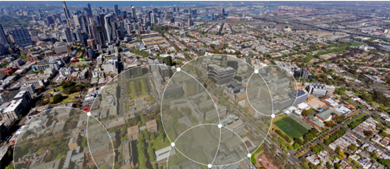
Melbourne Biomedical Precinct (Parkville NEIC)