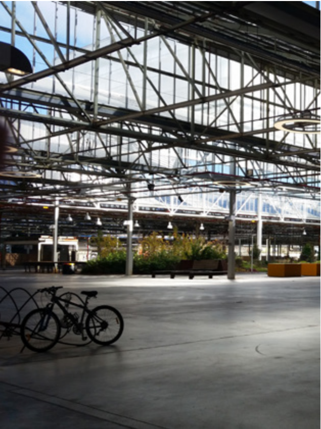
Tonsley Innovation District, South Australia

There is the potential for the formation of innovation districts – albeit different types – in any location where businesses are open to collaborative culture and governance structures. Policy needs to reflect this, rather than focus exclusively on premium locations for agglomeration.